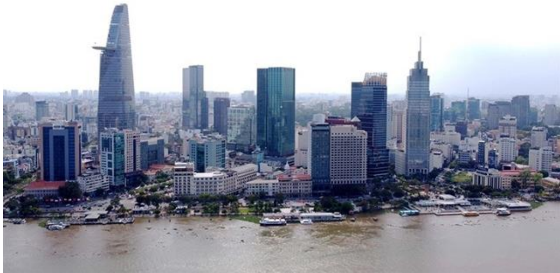
Fig. 2: A view of downtown HCM City

In this context, the role of governmental oversight is instrumental. State management influences the intricate balance between traditional and modern architectural elements, utilizing administrative authority and comprehensive management strategies to steer architectural development. Government actions play a decisive role in setting the direction for architectural progress, ensuring the alignment of development objectives with conservation efforts. This involves formulating and executing policies and strategies aimed at fostering architectural growth in both urban and residential sectors. The state's role is thus critical in creating an environment conducive to architectural preservation and innovation, ensuring that Ho Chi Minh City's architectural future is a reflection of its rich historical heritage, seamlessly blended with modern design paradigms.